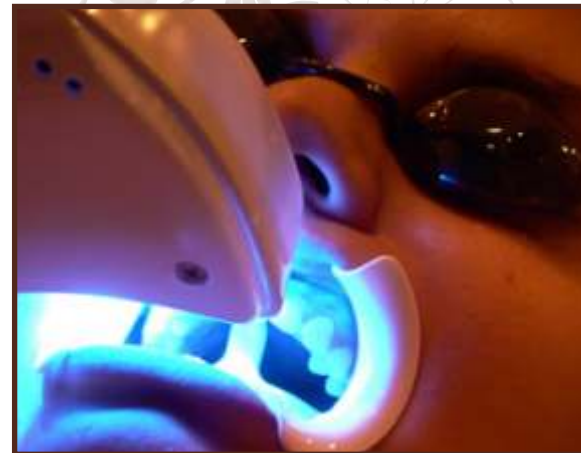
Teeth Whitening at the Mall?

Many people have wondered about bleaching kiosk sprouting up in malls. Many states including Tennessee, North Carolina, South Carolina, and California are requiring the treatments to be performed only by licensed professionals. These state's Boards of Dentistry have determined based on its research and legal opinion, that prescribing and dispensing teeth whitening formulations is the practice of dentistry. If you're interested in whitening your teeth please ask at the office because some patients are even great candidates for the over-the-counter products. Our custom tray home bleaching is now easier, as you only need to leave the bleach on for 30 minutes a day. 🌸